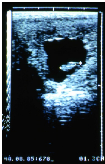
Figure 1 (Upper Left). A 14-day embryonic vesicle measuring 17 mm in diameter. Figure 2 (Upper Right). A 24-day pregnancy with a 13 mm fetus and 32 mm vesicle.